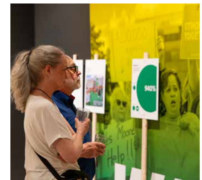
Visitors at the opening of Collective Action