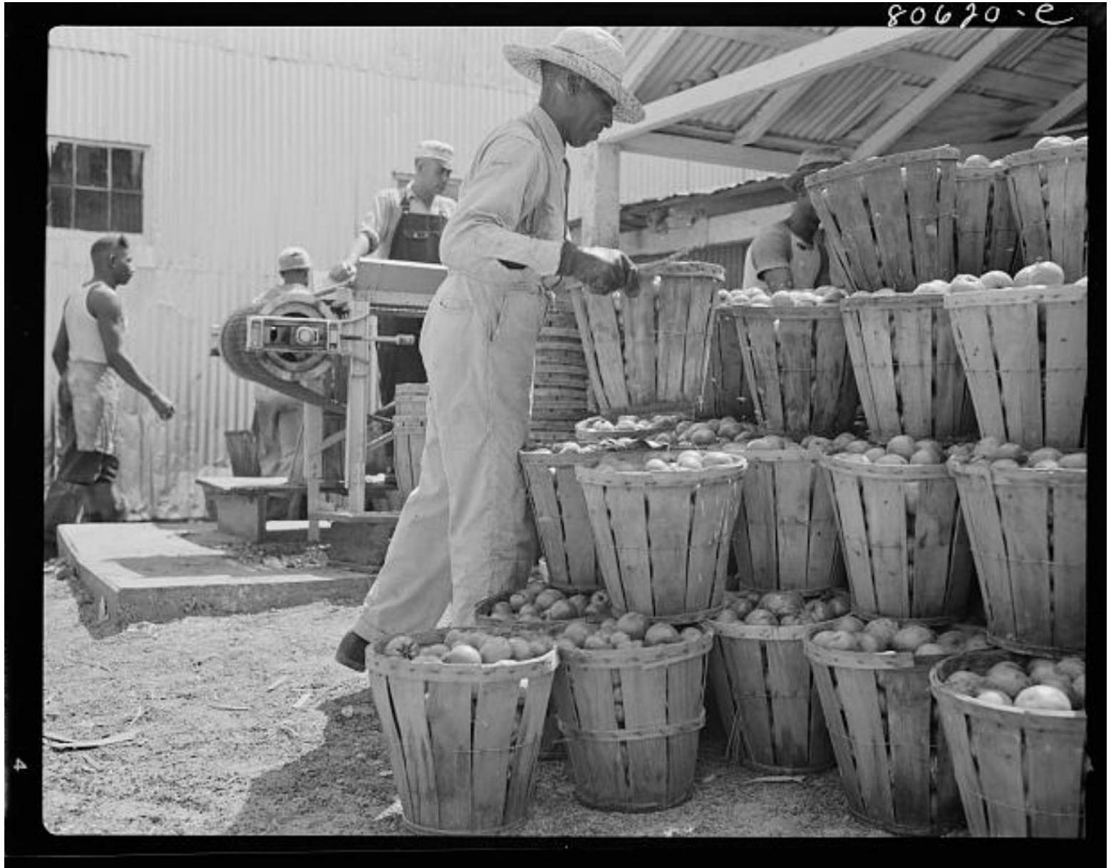
Fresh from the field, tomatoes ready for canning. August 1941.