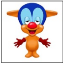
The dreaded Gremlin.

The Lilliputians are looking for a reliable paper airplane that their human handlers can use to send them where needed to defend the airport. The Lilliputians are looking for a design that can be manufactured quickly but reliably by assembly line techniques. The planes must be easy enough to be thrown far, fast, and accurately by elementary school students. Paper clips will serve as surrogate Lilliputians for testing purposes.