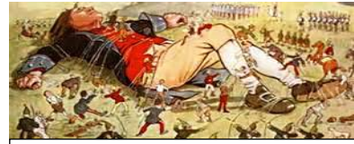
Lilliputians subdue Gulliver

The Lilliputians, a race of tiny people first discovered by that intrepid traveler Gulliver, guard BWI airport from the dreaded Gremlins, a mischievous sort of tiny creature who delight in jinxing pilot, plane, and traveler alike (see the Bugs Bunny classic, "Falling Hare").